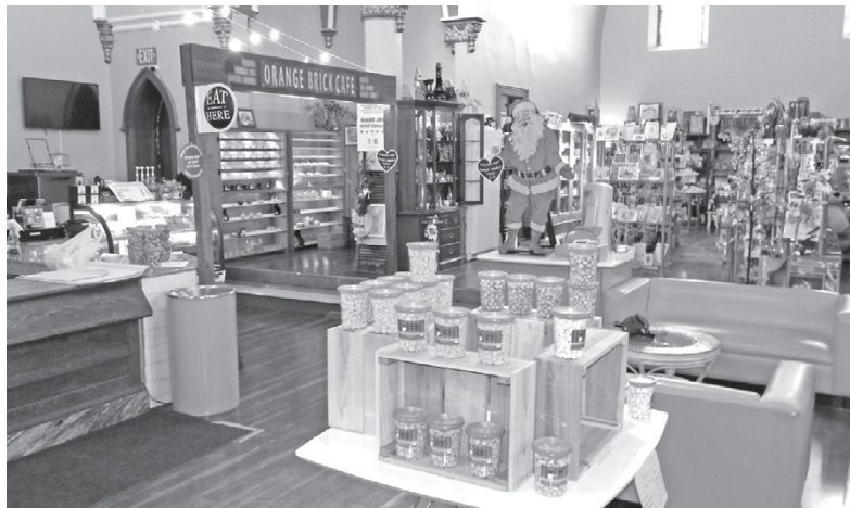
Visit “Christmas at the Chapel” on Saturday, Dec. 5.

√ “I’ve popped in a few times now to explore the remnants of